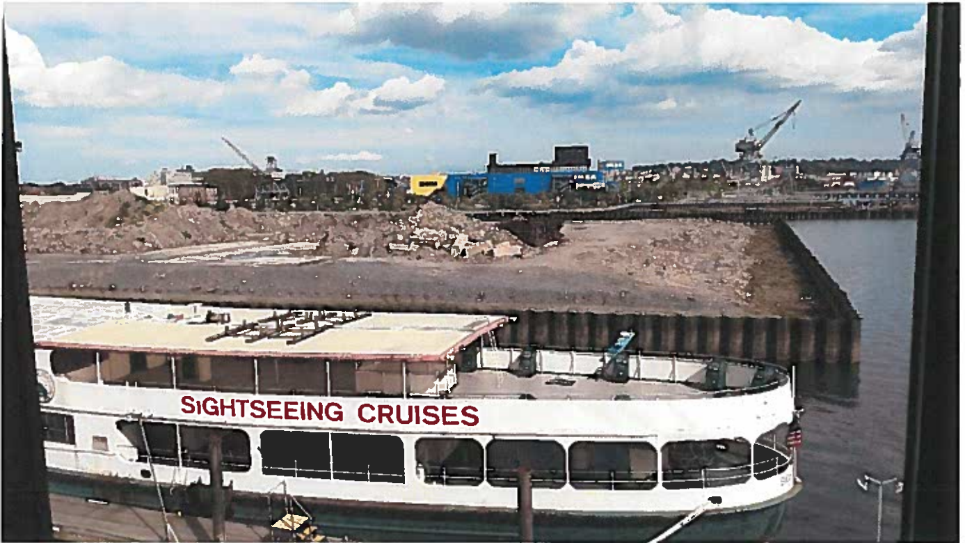
Photos of the dirt mounds.