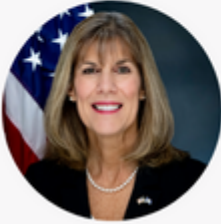
NYS SENATOR DAPHNE JORDAN (R, C, IP, REF) 43RD SENATE DISTRICT