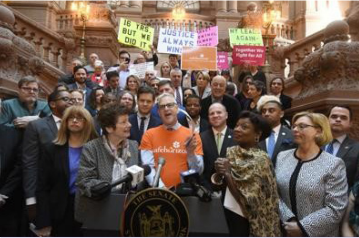
NYS Senate Majority Leader Andrea Stewart-Cousins at the January 28, 2019 press conference on the Child Victims Act.

After fighting on behalf of survivors of child sex abuse for more than a decade, victims’ voices were finally heard. We successfully passed the Child Victims Act and removed barriers that had been protecting predators for too long and rightfully helped victims seek justice.