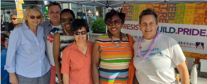
NYS Senate Majority Leader Andrea Stewart-Cousins stands with constituents at the 2018 Yonkers PRIDE event.

My doors are open from 9:00 a.m. – 5:00 p.m. every weekday to anyone looking for assistance. You can also propose ideas for a new program or law or express your support for existing legislation! You can visit my office at 28 Wells Avenue (Building #3) in Yonkers, send an email to scousins@nysenate.gov , or call (914) 423-4031 to make your voice heard. Hablamos español.