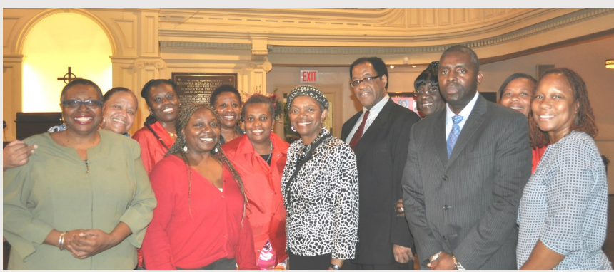
Senator Montgomery with members of CWA Local 1180

The event was co-sponsored by the New York State AFL-CIO, New York State United Teachers (NYSUT), New York State Nurses Association, Transport Workers Union Local 100, Council of School Supervisors & Administrators (CSA), CWA Local 1180, District Council 1707, 32BJ SEIU, UFCW Local 1500, United Federation of Teachers (UFT), Teamsters Local 237, District Council 37 (DC 37), United University Professions (UUP), UAW, Region 9A.