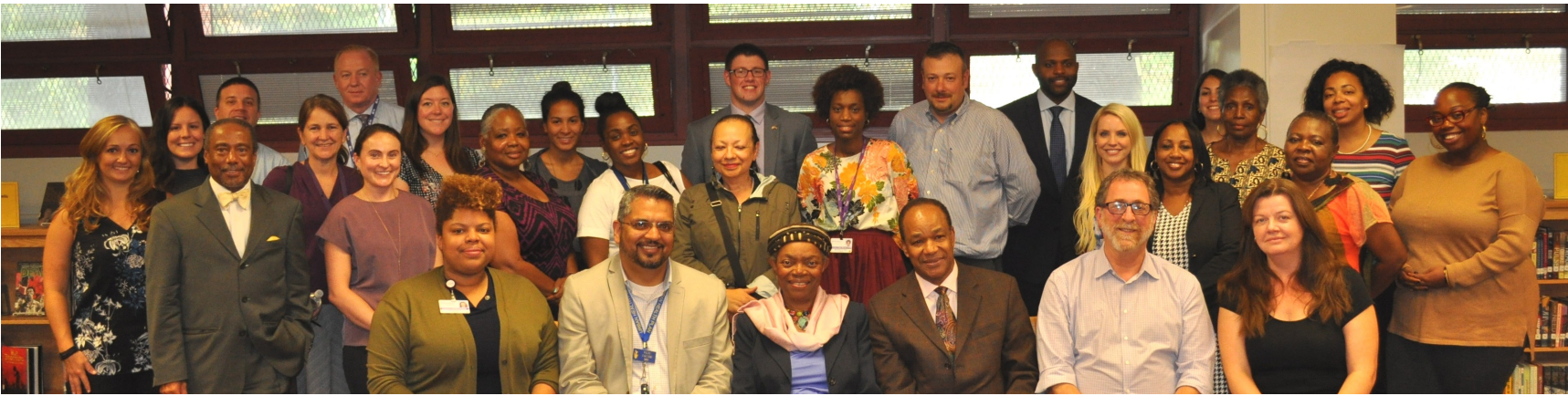
School Based Health Centers in the 25th Senate District (July 1, 2016 - June 30, 2017)

On the federal level, health care is being dismantled brick by brick which includes funding for the Children's Health Insurance Program (CHIP) and community health centers. Senator Montgomery is committed to serving as a voice for young people in the Legislature and to make sure they are prioritized, not put on the chopping block year after year.