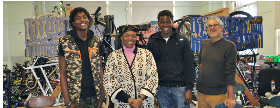
Pathways to Graduation (P2G) students at Old Boys High learn bike-repair skills as part of a collaboration with Recycle-A-Bicycle and Citibikes.

Pathways to Graduation (P2G), a free full-time program for young people 17-21 who seek to earn a high school equivalency diploma. Students may enroll throughout the year and are provided with support services as well as bilingual preparation. Several students have also been hired out of their Bike Repair Program where young people learn applicable skills and donate refurbished bikes to the community.