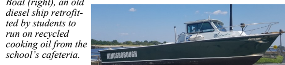
Boat (right), an old diesel ship retrofitted by students to run on recycled cooking oil from the school's cafeteria.

Kingsborough Community College, part of the City University of New York system, is the only community college in Brooklyn. Kingsborough's Maritime Technology Program offers courses in Oceanography, Seamanship, Navigation, Marine Electronics, Ship Handling, Sailing, Marina Operations, Vessel Repair, Fiber-glassing, Welding, Diesel and Outboard Engines, Safety and Survival, First Aid, CPR, Fire Fighting and STCW Certification.