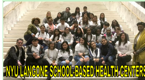
NYU LANGONE SCHOOL-BASED HEALTH CENTERS

"SBHC BILL" - CREATES A PERSONAL INCOME TAX CHECK-OFF BOX TO SUPPORT SCHOOL-BASED HEALTH CENTERS (S4487B/A2660B). The bill creates a School-Based Health Centers fund, managed by the State Comptroller, to support the expansion of medical services at existing school-based health center sites or to establish new sites throughout New York State. Senator Montgomery is a longtime advocate of School-Based Health Centers and there are 12 SBHCs located in the 25th Senate District.