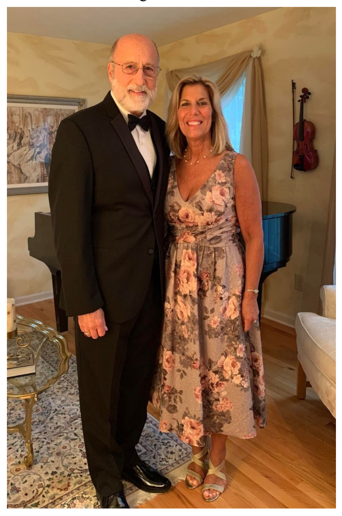
We had a wonderful time at a terrific Travers Party last Friday night in Saratoga Springs. Many thanks to our gracious host!