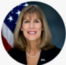
NYS SENATOR DAPHNE JORDAN (R, C, IP, REF) 43RD SENATE DISTRICT