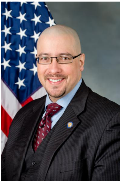
State Senator Gustavo Rivera