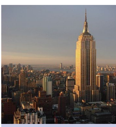
The Empire State Building

with a record 128 countries and territories joining this global display of climate action.