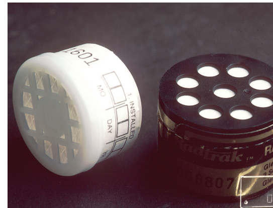
Radon test kit.

Radon is a colorless, odorless gas that results from the natural breakdown of uranium in soil, rock and water. While radon in small amounts is naturally present in the air you breathe, unusually high levels can be harmful. Fortunately, there are test kits available that enable you to easily test your home environment for both the presence of radon and its levels. To purchase a test kit, call the NYS Department of Health's Center for Environmental Health at (518) 402-7556 between 8:30 a.m. and 4:30 p.m., Monday through Friday. Kits come with complete instructions and are simple to use. For more details on radon, testing and/or the effects of exposure, you may contact the National Radon Hotline at (800) 55RA-DON (557-2366).