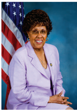
NEW YORK STATE SENATOR SHIRLEY L. HUNTLEY 10 TH SENATORIAL DISTRICT HUNTLEY.NYSENATE.GOV