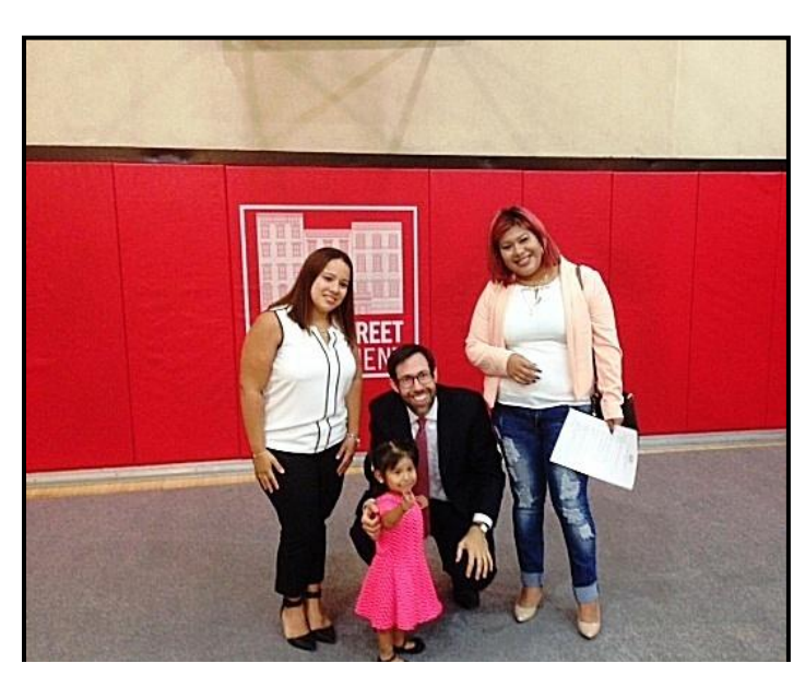
I co-sponsored a Senate Social Services hearing on delivering services from prenatal to pre-k, and spoke on the importance of maternal home visiting programs.