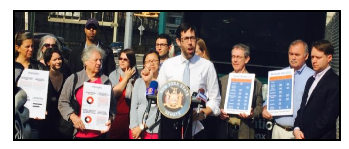
Announcing the results of my Subway Station Survey with advocates and local community members.