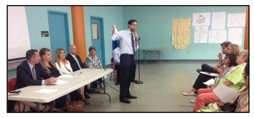
Speaking to residents at Extell Quarterly Construction Meeting.