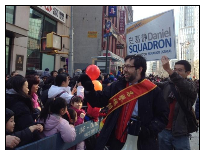
Marching in this year's Lunar New Year Parade.