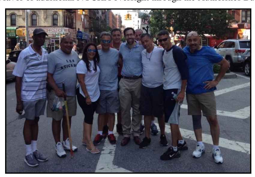
Taking in a summer stickball game at Rutgers Houses.