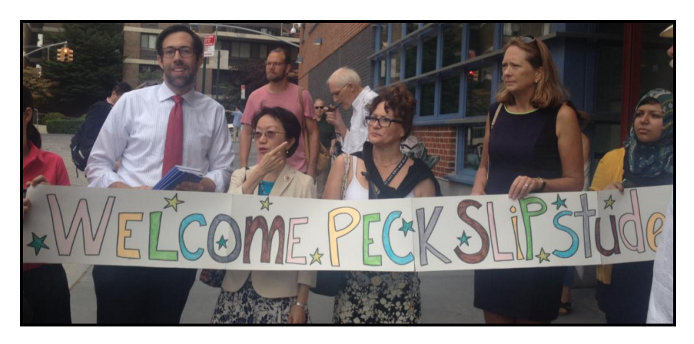
Welcoming students on the first day of classes at the new Peck Slip School, along with Councilmember Chin, Community Board 1, parents and community members.