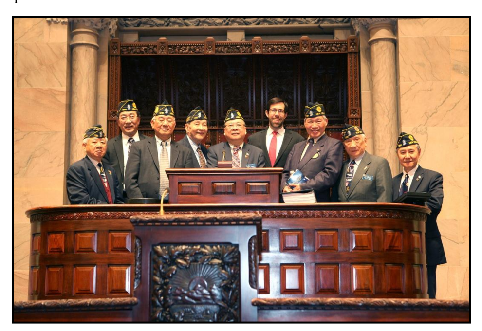
Honoring Lt. B.R. Kimlau American Legion Post 1291 as Veterans Hall of Fame Nominees in the Senate Chamber.