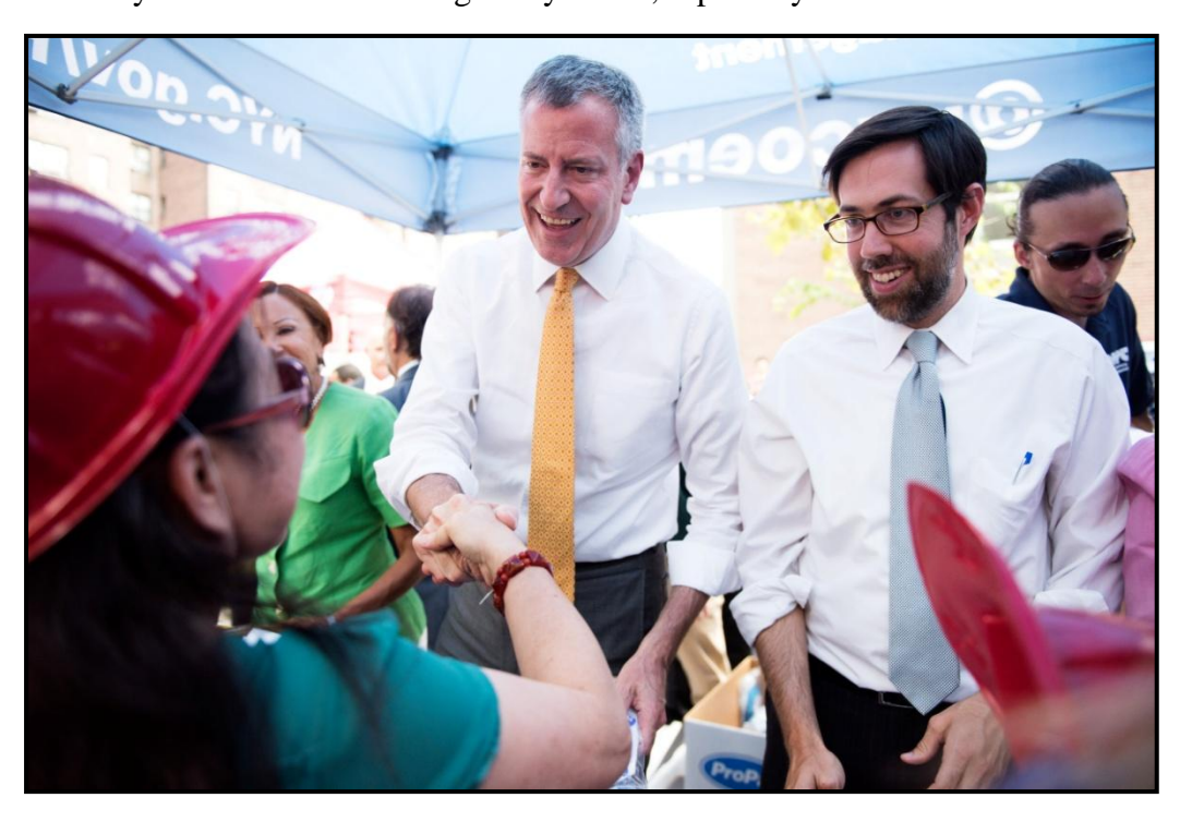
Handing out Emergency Preparedness kits at Smith Houses with Mayor de Blasio and Congresswoman Velazquez.