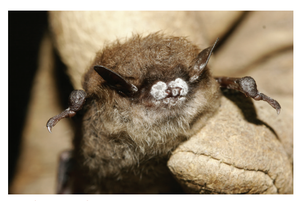
A close-up of a little brown bat with white-nose syndrome.

The disease gets its name from one of its symptoms, a white fungus that appears around bats' noses and wings. The fungus thrives in the cool and humid environmental conditions typical of the caves and mines where bats often hibernate.