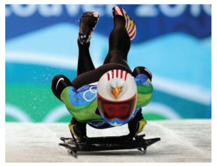
Olympian Skeleton Racer Katie Uhlaender begins a run down the track.

Thrill seekers looking for an Olympic adventure have an array of options available to them at the site of the 1980 Winter Olympics in Lake Placid, New York.