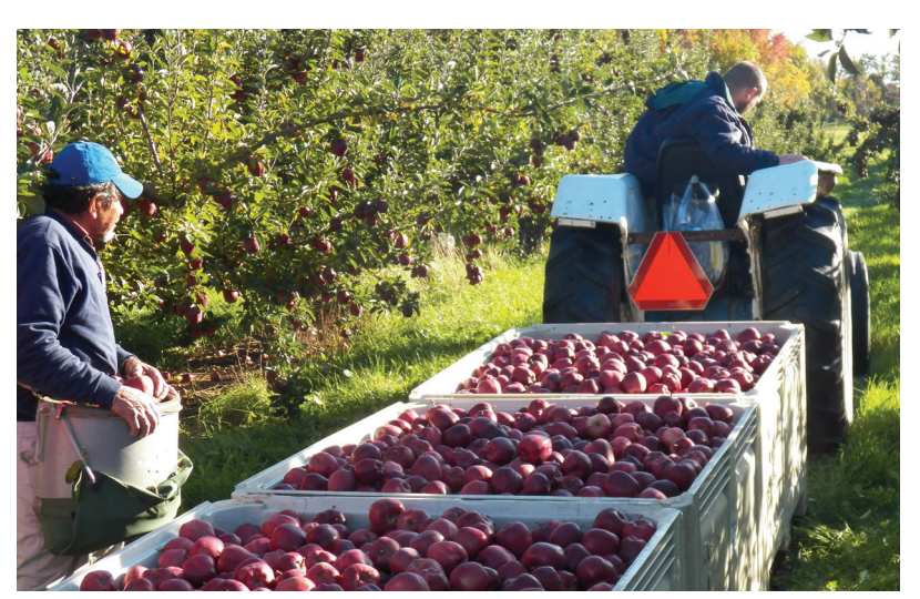
Apples being carefully picked and loaded into bins at Bittner-Singer Orchards. Depending on the size of the fruit, each bin contains about 1,800 apples.

When the picking container is full, it has about 35 pounds of apples in it. After setting it in the apple bin, the picker carefully opens the bottom of the picking container, and slowly releases the apples into the bin. The apples roll into the bin, preventing the bruising that could occur if they were dropped.