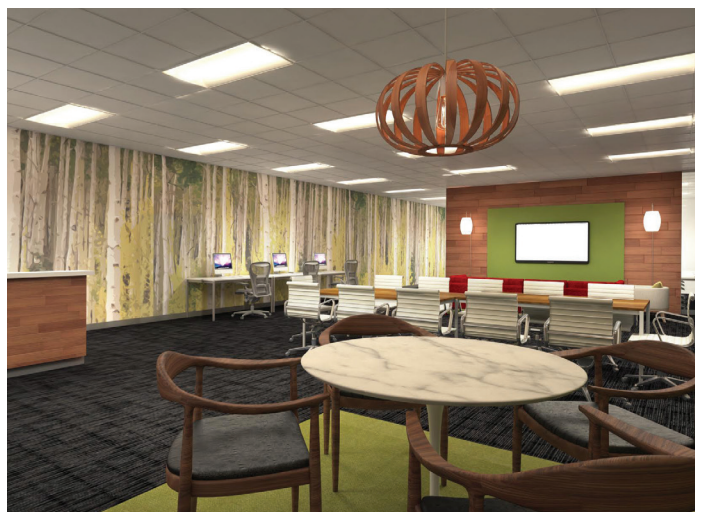
Artist's rendering of the interior of the Senior Planet Exploration Center in the Champlain Centre shopping mall in Plattsburgh, New York.

Older Adults Technology Services (OATS), a New York City-based nonprofit, is leading an initiative in New York's North Country to help more seniors improve their quality of life and enhance their social and civic engagement through the Internet.