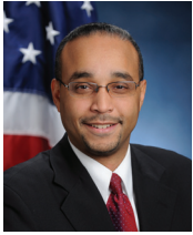
SENATOR JOSE PERALTA