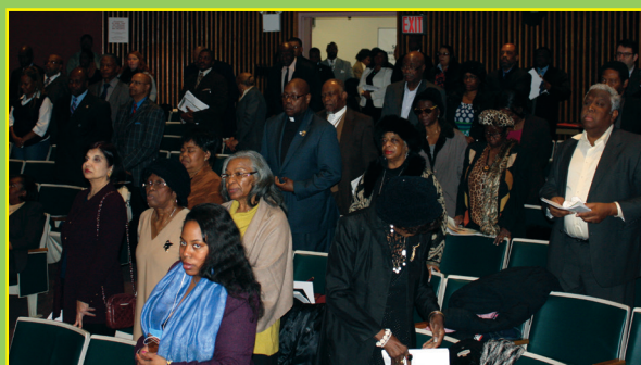
Faith based leaders assembled for Senator Persaud's Interfaith Breakfast