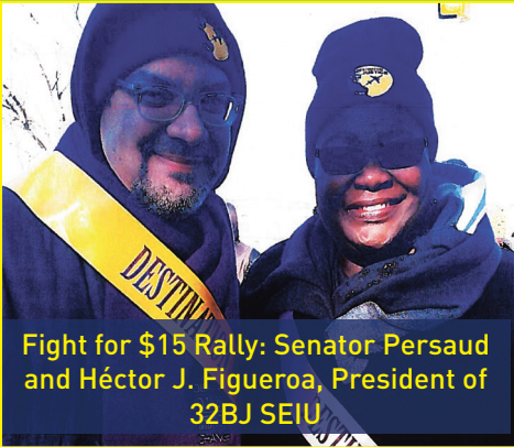
Fight for $15 Rally: Senator Persaud and Héctor J. Figueroa, President of 32BJ SEIU

How can anyone support themselves let alone, their families on $360 a week? The current minimum wage needs to be raised so thousands of New Yorkers will be able to sustain themselves and their households. I will continue to rally with my colleagues, the unions and other advocates in the fight for $15 per hour.