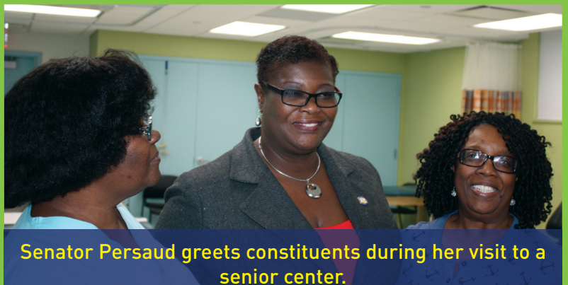
Senator Persaud greets constituents during her visit to a senior center.

Monday: 9:00 AM – 7:00 PM Tuesday: 9:00 AM – 5:00 PM Wednesday: 9:00 AM – 5:00 PM Thursday: 9:00 AM – 5:00 PM Friday: 9:00 AM – 5:00 PM