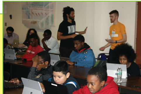
Students engaged in a codefest at the Hackathon

On Saturday, February 20th my colleagues and I joined Codesters to host a Youth Achievement Hackathon at Brookdale Hospital. Who are Codesters? Codesters is an organization dedicated to teaching computer programming to youth.