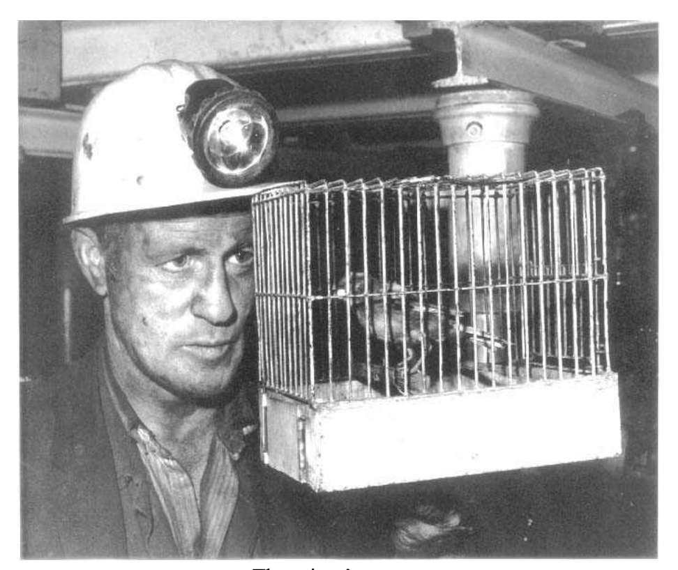
The miner's canary

my 350 page compendium on lead paint laws<sup>2</sup> is widely used as a reference by practitioners. A paper I co-authored, published by the New York State Bar Association in 2019<sup>3</sup> and attached and submitted as part of my testimony, covers many of the points I wish to make here today.