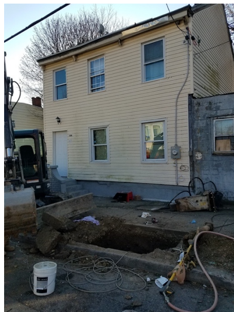
Figure 6 – An LSL replacement in Newburgh funded by DOH’s LSLRP

Fortunately, New York has gained experience facilitating LSL replacement over the last several years. In 2017, state lawmakers created the Clean Water Infrastructure Act, which in turn created the Lead Service Line Replacement Program (LSLRP). The LSLRP, administered by DOH, provides grants to local governments to dig up the full length of LSLs at no cost to either the local government or the homeowner. This ensures that homeowners who are struggling to pay the bills, often in low-income communities and communities of color, aren't faced with an additional financial burden, a crucial component of environmental and economic justice.