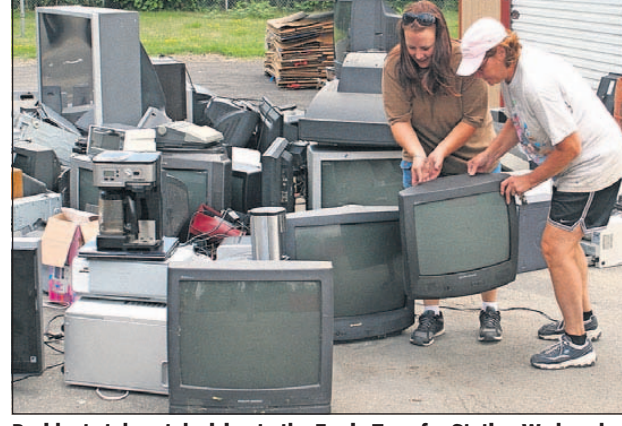
Residents take a television to the Erwin Transfer Station Wednesday.