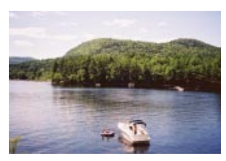
Great Sacandaga Lake