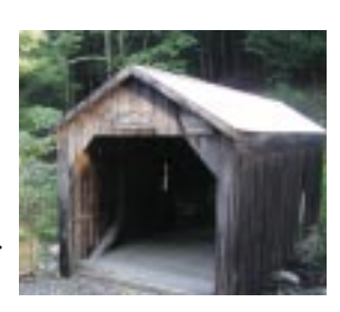
Copeland covered bridge, Edinburg