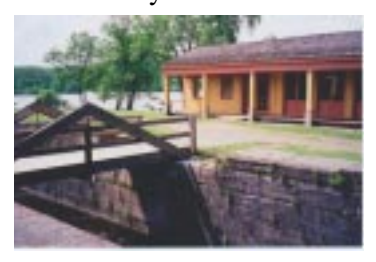
Putman's Canal Store, Schoharie Crossing