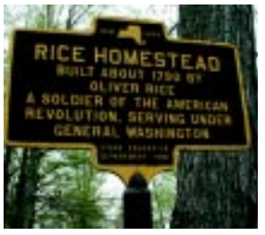
Rice Homestead historical marker

4. (B) "Goldie" is the organ at Proctor's Theatre. This vaudeville theater opened in 1926, and the organ was important for vaude-