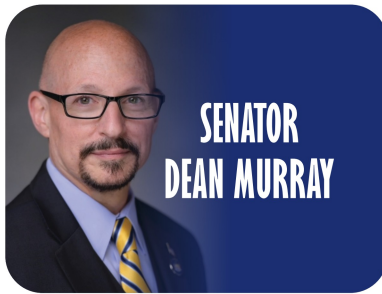
SENATOR DEAN MURRAY