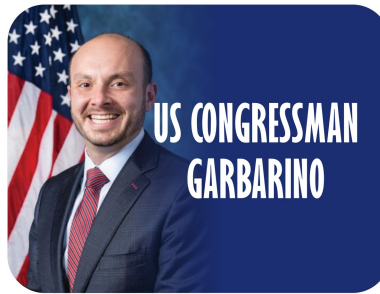
US CONGRESSMAN GARBARINO