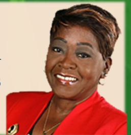
Assemblywoman Crystal Peoples-Stokes