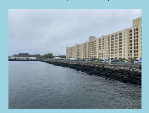
Interstate Environmental Commission

The Interstate Environmental Commission (IEC) is a tri-state agency committed to protecting, conserving, and restoring New York's environment, particularly in the area of water quality. One of IEC's most valuable resources is its independent, accredited environmental laboratory. IEC's laboratory primarily analyzes non-potable water samples collected throughout the tri-state area in conjunction with coordinated projects designed to support IEC's mission. The laboratory holds primary National Environmental Laboratory Approval Program (NELAP) accreditation through the Environmental Laboratory Approval Program (ELAP) of the New York State Department of Health (NYSDOH).