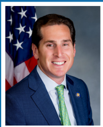
Senator Todd Kaminsky Chair Committee on Environmental Conservation