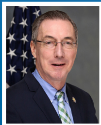
Senator James Gaughran Chair Committee on Local Government