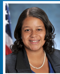
Assemblywoman Michaelle C. Solages Chair Task Force on Food, Farm & Nutrition Policy