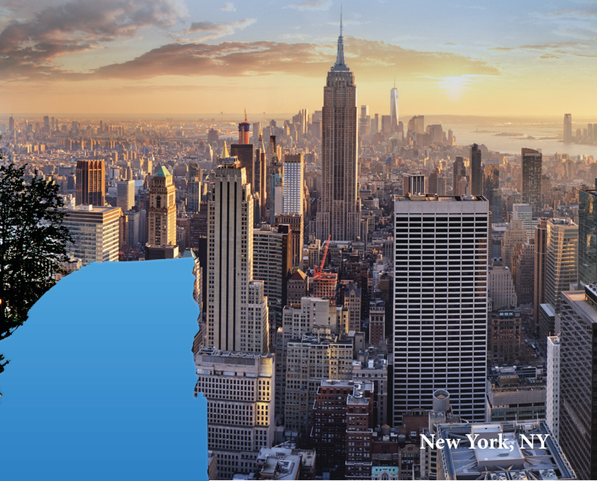
New York, NY