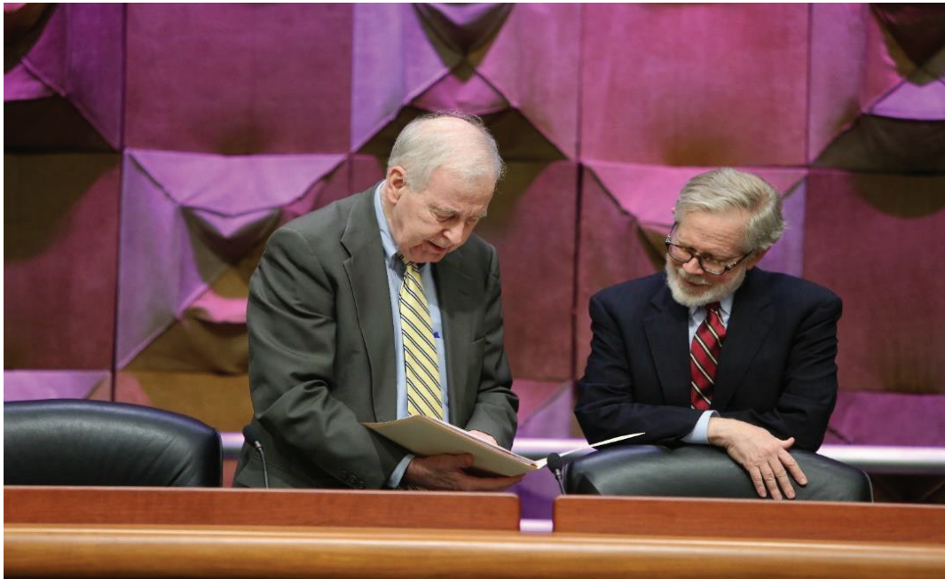
Senate Health Committee Chair, Kemp Hannon (left) and Assembly Health Committee Chair, Richard Gottfried (right)

The budget continued the state’s record commitment to the protection of natural resources with $300 million for the Environmental Protection Fund (EPF). The EPF helps protect water resources through the preservation of open spaces and upgrading sewage treatment plants, among many other environmental initiatives. To further support clean water projects, $20 million from the EPF will help support existing funding in the Water Quality Improvement Program.