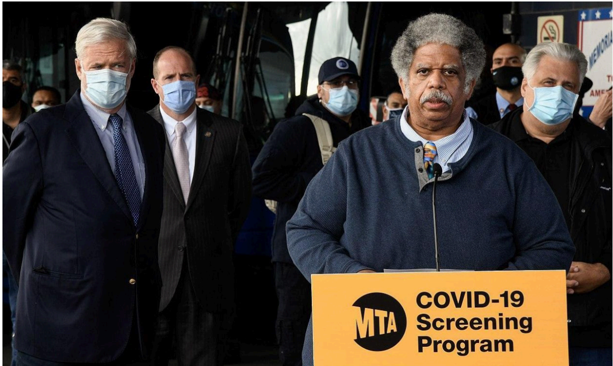
Senators Comrie and Kennedy advocated for COVID-19 testing and vaccines for MTA and Regional transportation workers.