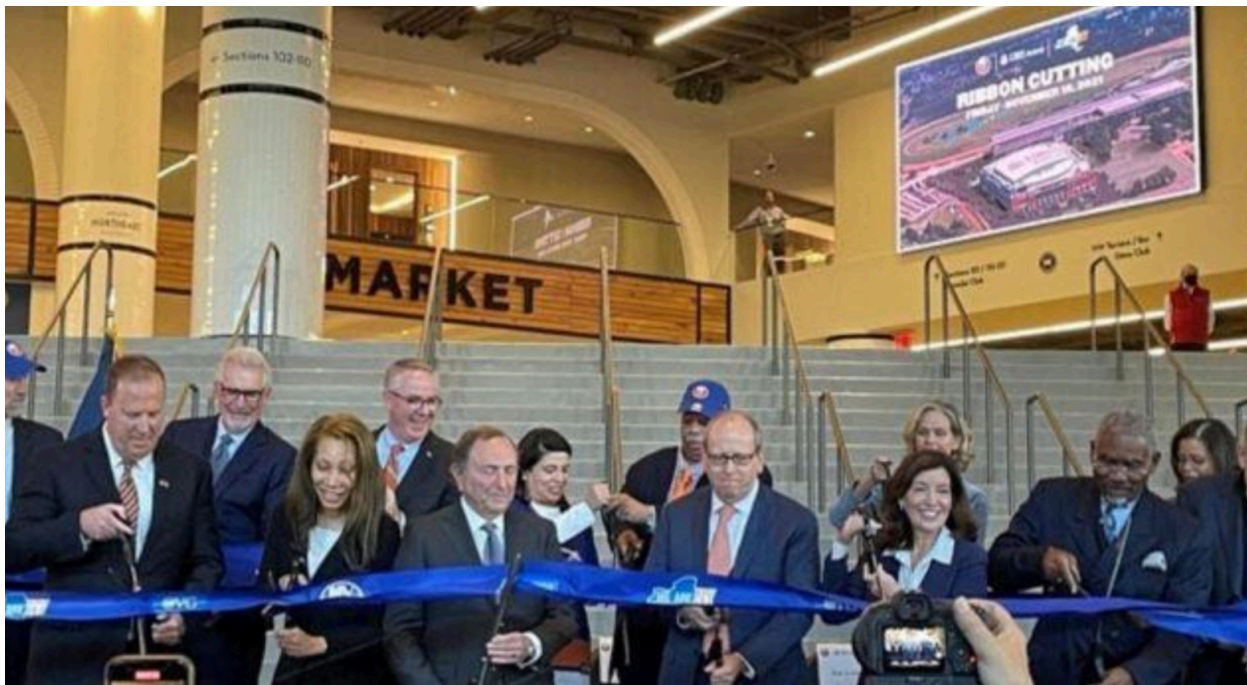
Senator Comrie, Governor Hochul and colleagues at the opening of the UBS Arena.

This law requires the proactive provision of helpful information by the Secretary of State to new businesses—providing, at a minimum, that they are aware of the vast array of supportive services New York offers to business entities, including those undertaken by: (1) The Small Business Development Center; (2) The Entrepreneurial Assistance Center; (3) Business Mentor NY; and (4) Empire State Development. This bill would ensure that new business owners have clear directions to critical resources upon inception—which is the most important time in the life of a new business.