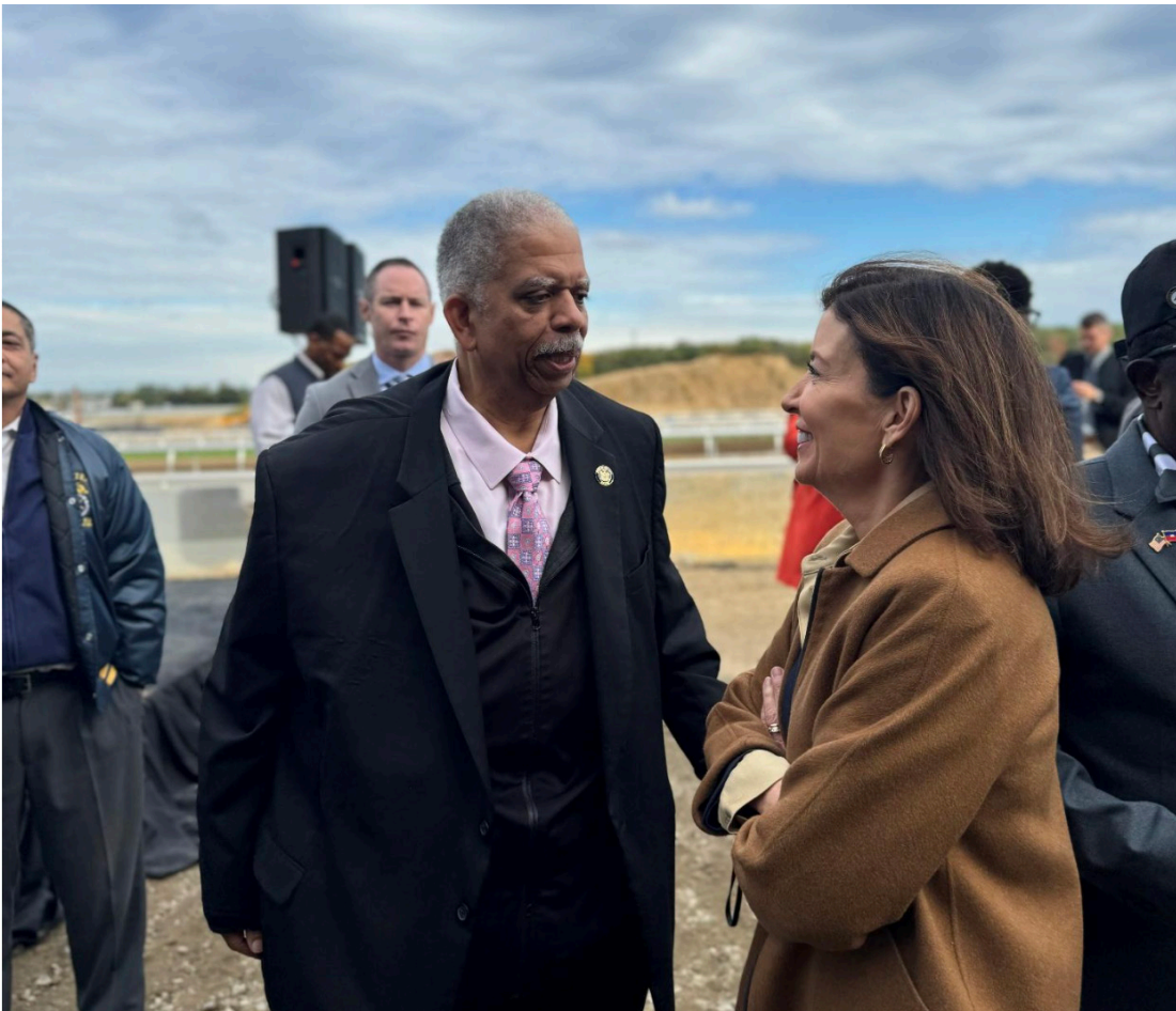
Governor Hochul meets with Senator Comrie at Belmont Park re: redevelopment.