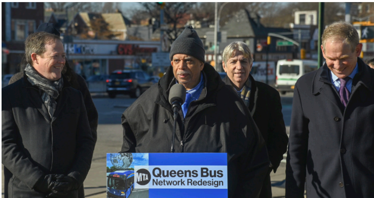
State Senator Leroy Comrie encouraging Queens residents to provide feedback on the MTA/NYCT bus redesign plan.