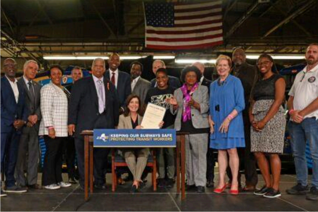
Governor Hochul signs legislation by State Senator Leroy Comrie to protect MTA workers.