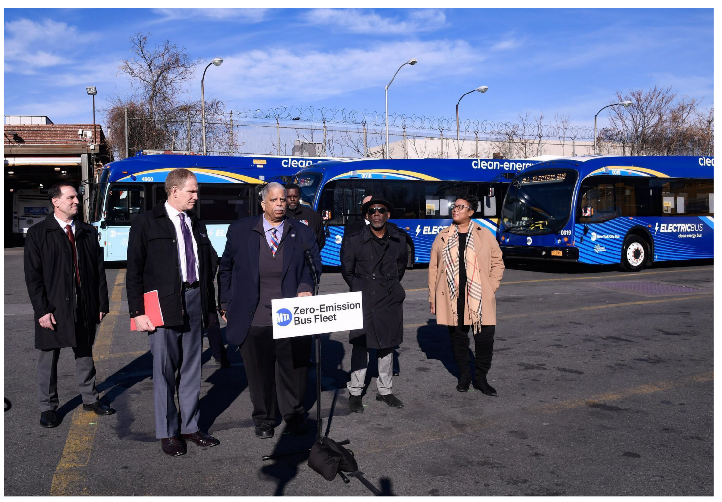
In April 2022 the Metropolitan Transportation Authority announced plans to deploy 60 zero-emissions electric buses at six bus depots in communities disproportionately impacted by asthma; the announcement marked an additional milestone in the commitment, made in 2018, to transition to an all zero-emission bus fleet by 2040.

In addition to its regular legislative meetings, the committee held a total of 1 public hearing, and 3 committee meetings to consider nominees for various public offices nominated by Governor Kathy Hochul for the respective Authorities that the committee oversees.