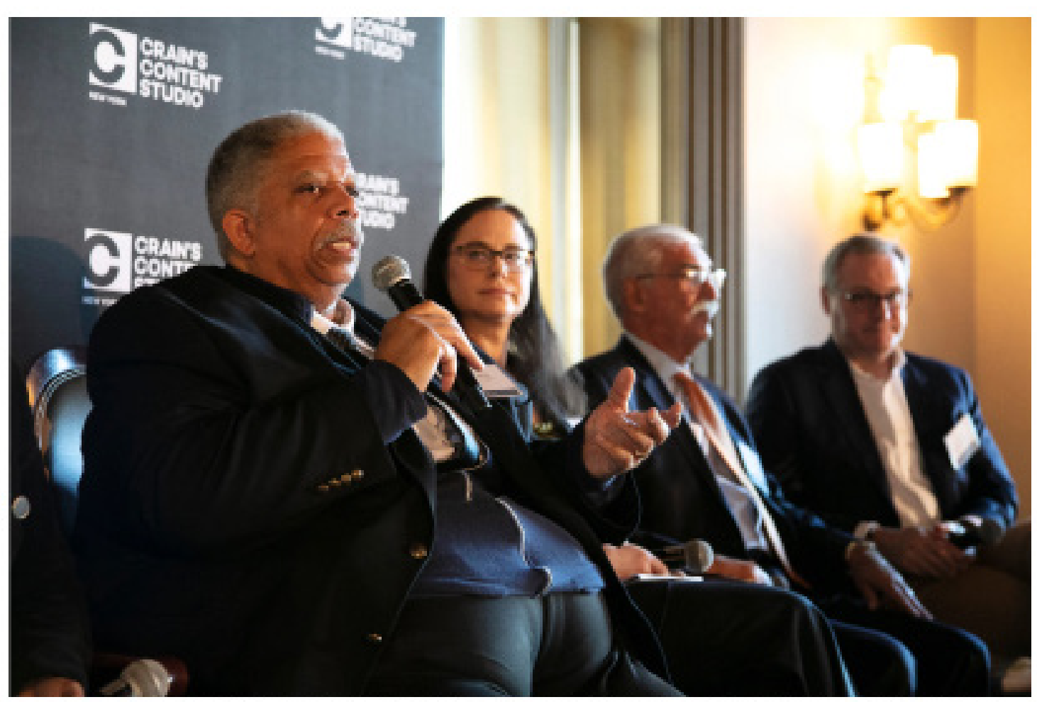
NYS Senator Leroy Comrie serves on a panel convened by Crain's New York Business on Penn Station Redevelopment; the panel focused on what the redevelopment project means for the future of New York City. Senator Comrie emphasized the importance of delivering a future-forward redevelopment plan and ensuring that both neighborhood residents and those residing throughout the region gain value for the multi-billion deliar investment New York, New Jersey, and the United States Department of Transportation will make in Penn Station Redevelopment.