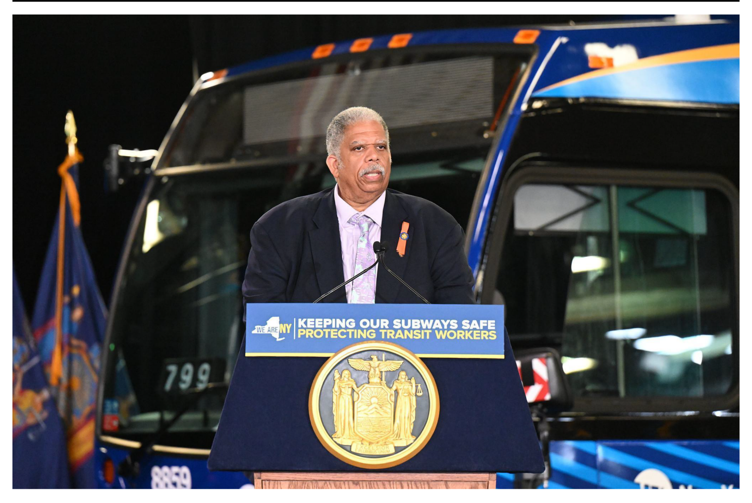
NYS Senator Leroy Comrie addresses those gathered to mark the signing of upgraded transit worker protections into law, S.9468, remarking that "Transit workers kept our city moving during the height of the pandemic and beyond, at great risk to themselves and their families. These heroes deserve safe workplaces and those who assault transit workers deserve to face penalties commensurate with their crimes. Recent events have made it clear how serious we have to be with regard to transit worker safety and I commend transit leadership, organized labor, and advocates who have all been key partners in making this a priority. I am grateful for their partnership and I am also grateful to my colleagues for their support and Majority Leader Stewart-Cousins and Speaker Heastie for their leadership. We all benefit when transit employees can focus on delivering safe, reliable service.