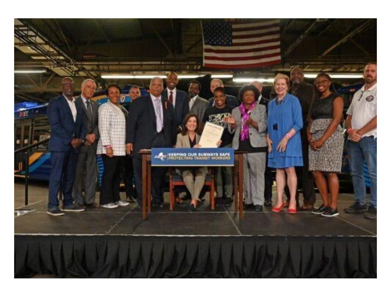
Governor Hochul signs legislation by State Senator Leroy Comrie to protect MTA workers.