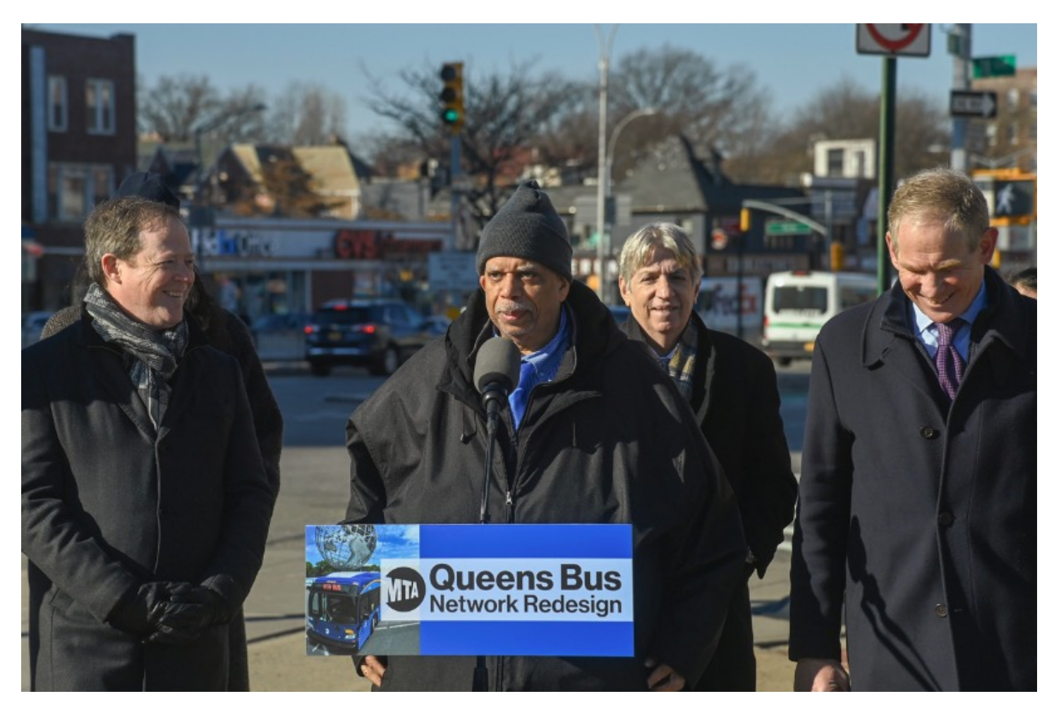
State Senator Leroy Comrie encouraging Queens residents to provide feedback on the MTA/NYCT bus redesign plan.