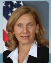
Senator Elaine Phillips

Member, Senate Task Force on Lyme & Tick-Borne Diseases