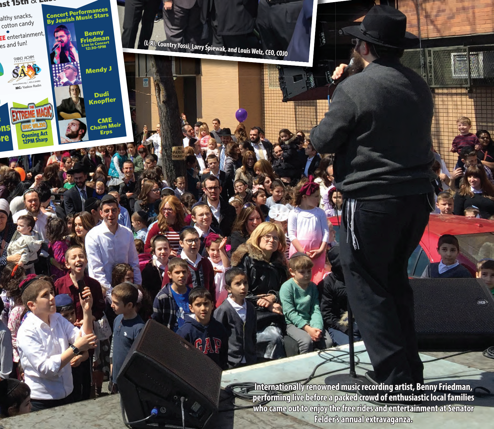
Internationally renowned music recording artist, Benny Friedman, performing live before a packed crowd of enthusiastic local families who came out to enjoy the free rides and entertainment at Senator Felder's annual extravaganza.