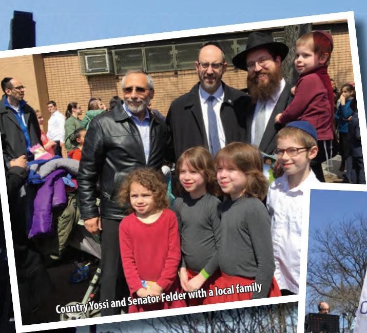
Country Yossi and Senator Felder with a local family