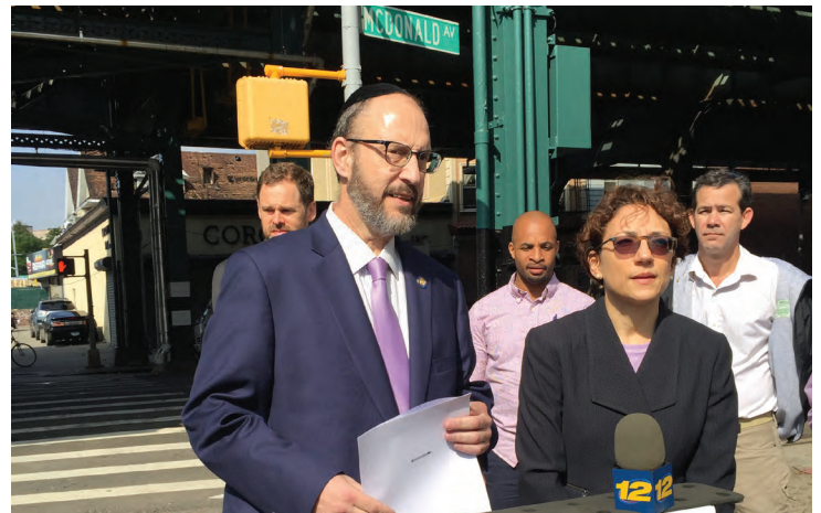
Senator Simcha Felder and NYC DOT Commissioner Polly Trottenberg share the spotlight at a recent press conference to unveil more than 100 new light poles, each with a dual illumination arm, lighting up McDonald Avenue's roadway and sidewalks from sundown to sunrise.

"Thanks to the de Blasio administration's DOT Commissioner, Polly Trottenberg, we can finally see the light on McDonald Avenue," concluded Felder.