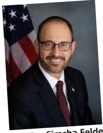
Senator Simcha Felder