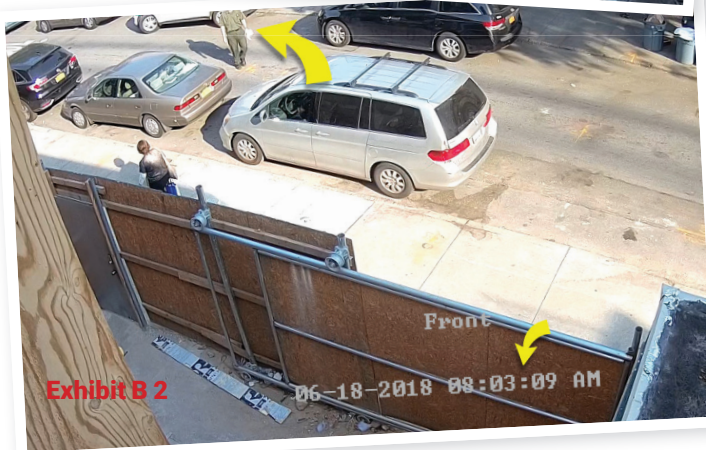
Exhibit B 2