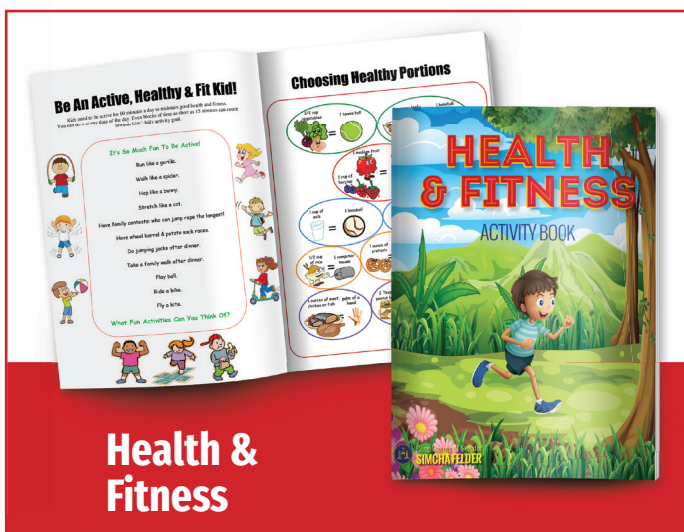
Health & Fitness