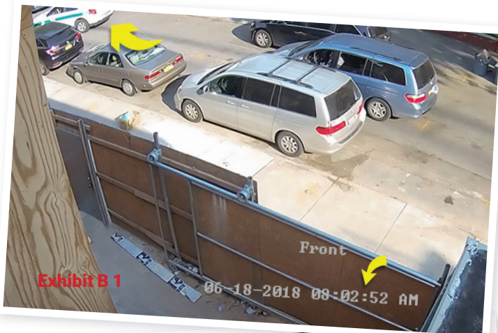
Exhibit B 1

In a third case, a constituent called my office after she was issued two DSNY sanitation tickets for the exact same violation. Her two-family house is clearly and legally one building. Because one house has two apartments, each with a separate house number, DSNY enforcement was intent on punishing the owner twice. It took eight months of work to finally have the duplicate ticket successfully removed, saving her $300 during this very difficult time.