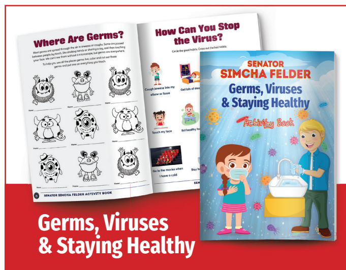
Germs, Viruses & Staying Healthy