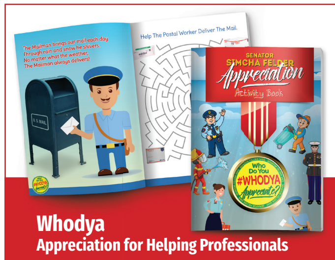
Whodya Appreciation for Helping Professionals

To order free activity books for the children in your life, parents, grandparents, teachers and friends can call my office at 718-253-2015 or email felder@nysenate.gov