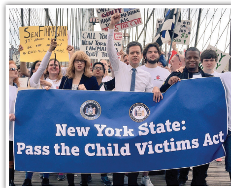
Marching across the Brooklyn Bridge with survivors of child sexual abuse.