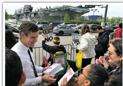
I distributed copies of the U.S. Constitution at anti-Trump rallies this spring.