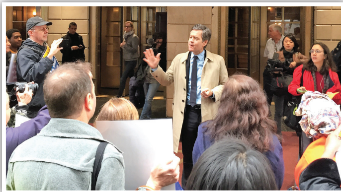
Rallying with tenant advocates outside Signature Bank’s board meeting in April.