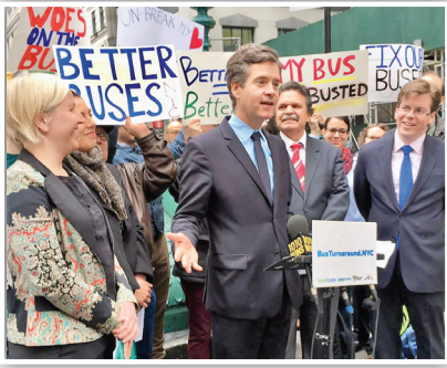
Joining advocacy groups to demand faster MTA bus service.