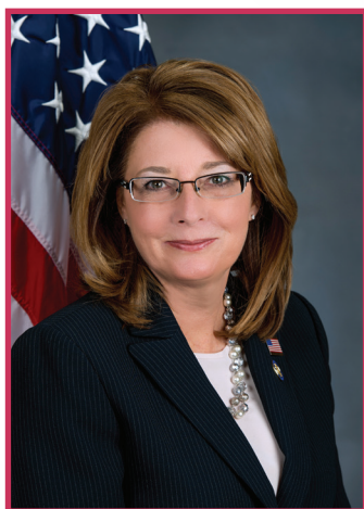
NYS SENATOR PAMELA A. HELMING