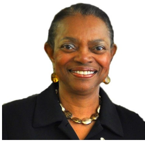
Senator Velmanette Montgomery