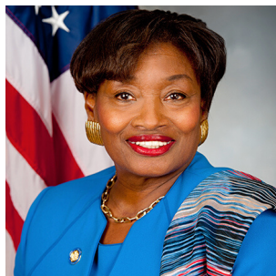
MAJORITY LEADER Andrea Stewart-Cousins

WHITE PLAINS TUESDAY, FEBRUARY 18TH 10:00 AM - 2:00 PM